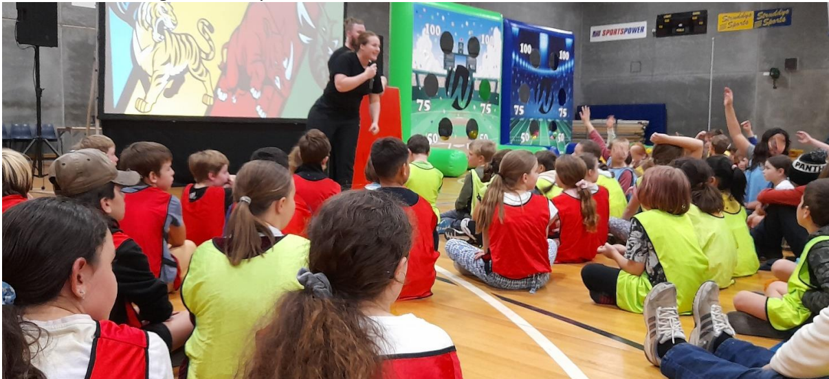
Over 80 Primary students attended Jnr KICK OFF

After cancelling the Word of Life KICK OFF events in 2021 due to COVID restrictions we had much to thank God for following the two KICK OFF events on Friday 27 th May. For over 10 years AYF have partnered with Word of Life Ministries to bring the good news of Jesus and a whole lot of fun to Armidale's youth. Many good things have happened, and continue happening, including students boldly inviting friends, the gospel being proclaimed to 80 Primary students and 90 high schoolers, connections between school and church, connections with parents over a free BBQ, 10 high school students accepting Jesus as saviour and 10 recommitting their lives to Jesus, 28 Bibles & 80 Testaments given out by Gideons, and much more.