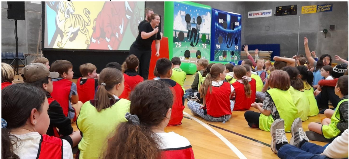
Over 80 Primary students attended Jnr KICK OFF

After cancelling the Word of Life KICK OFF events in 2021 due to COVID restrictions we had much to thank God for following the two KICK OFF events on Friday 27 th May. For over 10 years AYF have partnered with Word of Life Ministries to bring the good news of Jesus and a whole lot of fun to Armidale's youth. Many good things have happened, and continue happening, including students boldly inviting friends, the gospel being proclaimed to 80 Primary students and 90 high schoolers, connections between school and church, connections with parents over a free BBQ, 10 high school students accepting Jesus as saviour and 10 recommitting their lives to Jesus, 28 Bibles & 80 Testaments given out by Gideons, and much more.