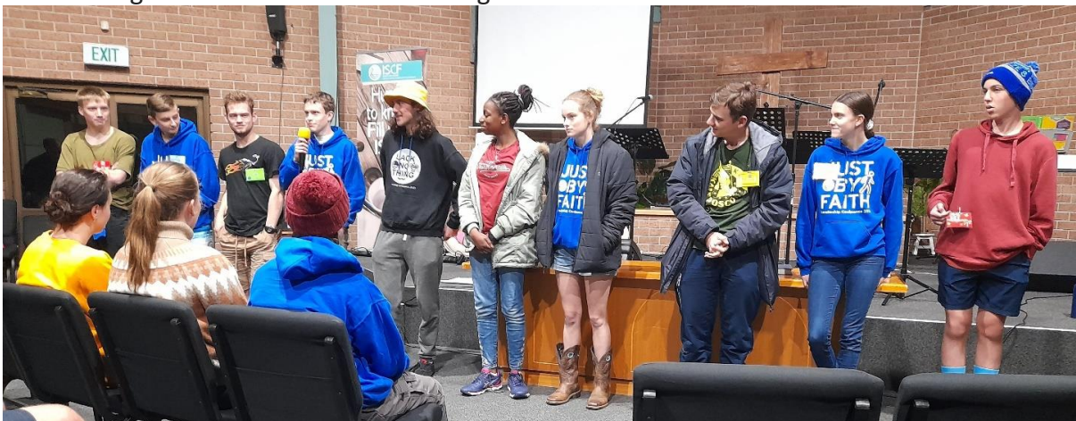
BOOST student leaders at Scripture Union Leadership Conference, July 2022

Our first event, BIG Arvo Tea at the Arboretum, was a special welcome for Year 7. It was exciting to have 4 new students along.