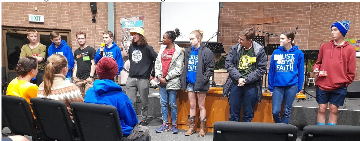
BOOST student leaders at Scripture Union Leadership Conference, July 2022

Our first event, BIG Arvo Tea at the Arboretum, was a special welcome for Year 7. It was exciting to have 4 new students along.